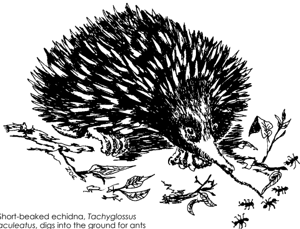
Short-beaked echidna, Tachyglossus aculeatus , digs into the ground for ants and termites

The creek lines and watercourses of the park provide habitat for several amphibians, including a new subspecies of the brown toadlet. Several snake species are present in the park, so take care when bushwalking.