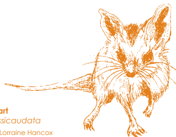
Fat-tailed Dunnart Sminthopsis crassicaudata

To escape the searing heat of the day, many of the Simpson Desert's mammal inhabitants only come out at night. Small marsupials including dunnarts and Ampurta come out to feast on insects, while Dingoes are out searching for bigger prey such as rabbits. If you've got a good field guide handy, try to identify the different tracks on the sand dunes in the morning. The desert is also home to feral animals including rabbits, camels and foxes.