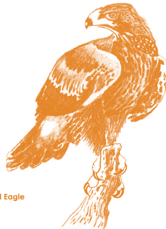
Wedge-tailed Eagle Aquila audax

For shorter trips, pick up a Remote Area Travel Information brochure from Desert Parks Pass stockists, download it from www.parks.sa.gov.au or free-call the Desert Parks Hotline on 1800 816 078 to find out more.