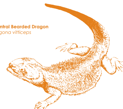
Central Bearded Dragon Pogona vitticeps

European settlement brought about the decline of Aboriginal occupation of the desert. White settlers introduced influenza to the Aboriginal groups, decimating the population. Groups were displaced as pastoral properties took over their land, while other Aboriginal people were attracted to work on properties and to towns and communities.