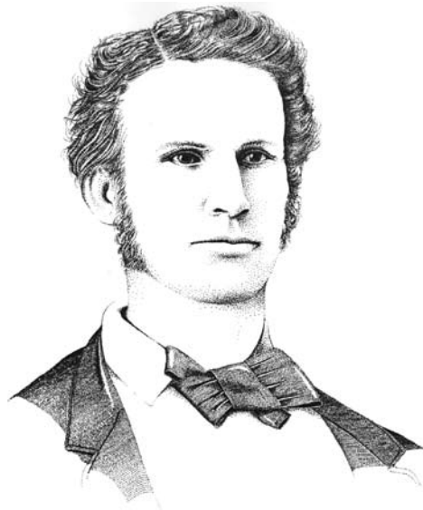
Adam Lindsay Gordon

The cottage has been restored to provide visitors with a fascinating glimpse of life in the 1860s. Gordon's personal belongings, and other mementos of this era, form part of the period collection. Dingley Dell was the first house on South Australia's Heritage Register, registered in 1922. It was built in 1862 and purchased by Adam Lindsay Gordon in 1864 for £150.