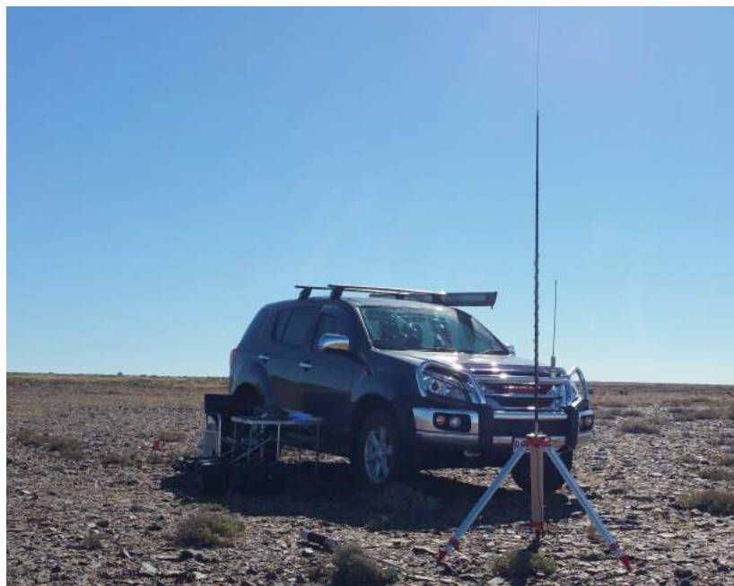
Above:- The set up of Andrew VK5MR at Lake Torrens.