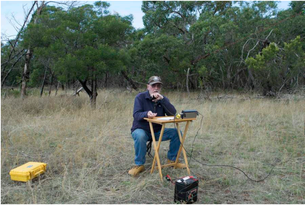
Above:- Col VK5HCF in the Gower Conservation Park.