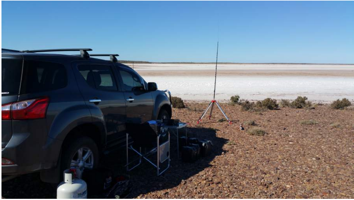
Above:- The set up of Andrew VK5MR at Lake Torrens.