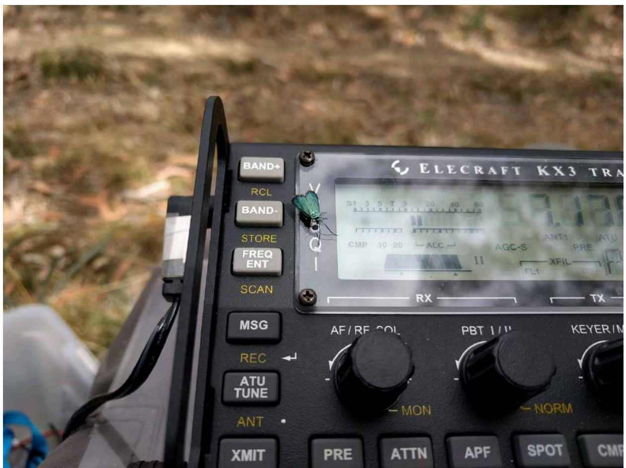
Above: - Mark VK5QI's Elecraft KX3 in action.