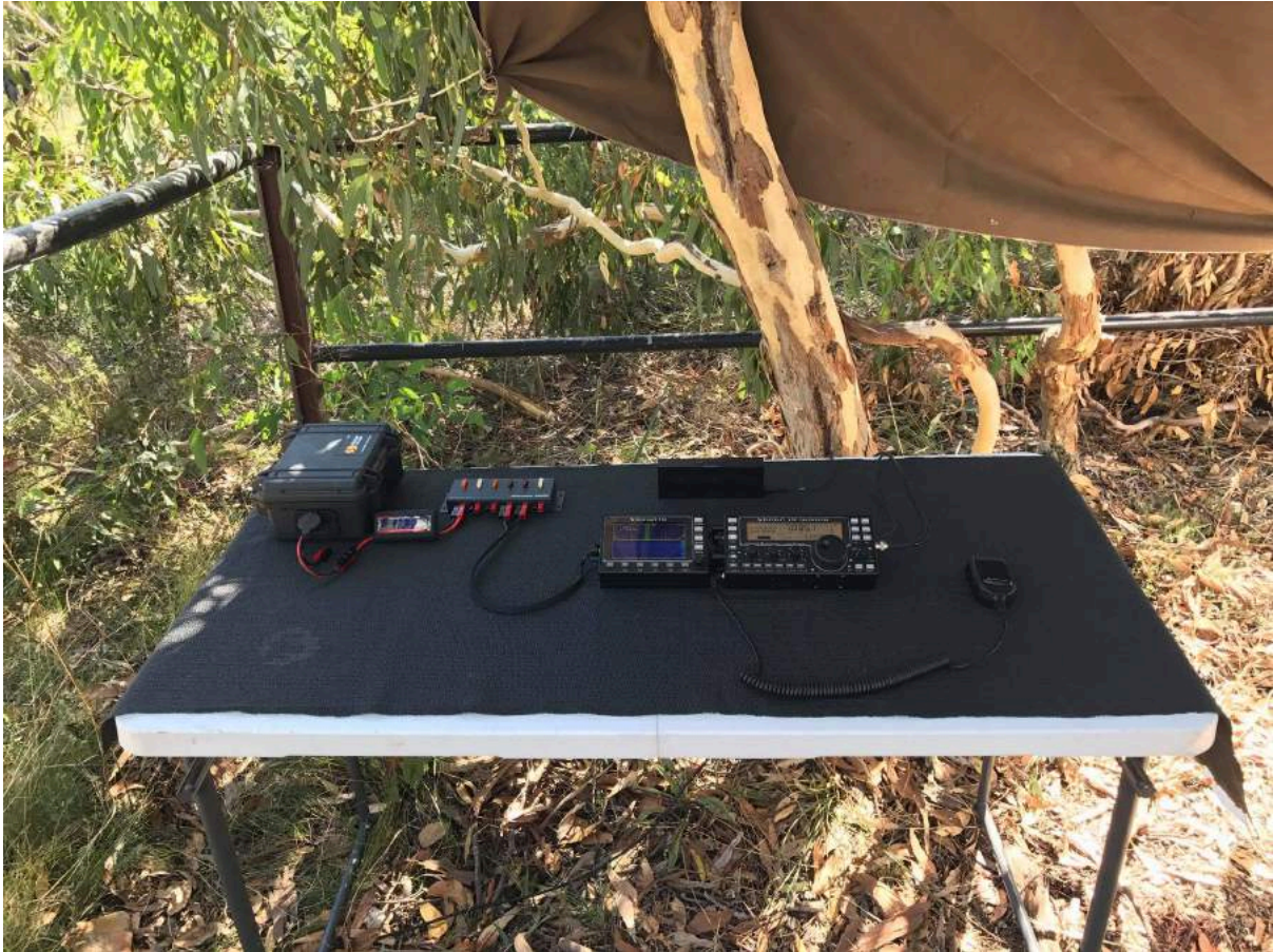
Above:- Set up of Gary VK5FGRY in Morialta CP.